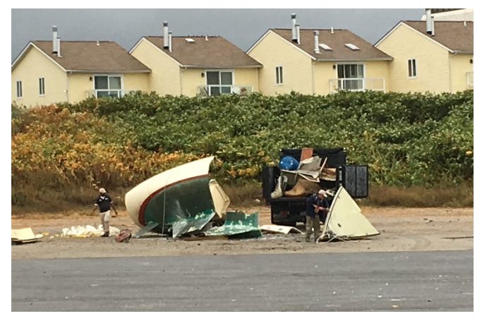
Figure 4. The yacht had to be cut into sections small enough to be taken for recycling

was only a modestly sized boat. Had there been a risk of injury or pollution, or had the owners not been responsible enough to to take prompt and effective action, this incident could have had a far less satisfactory outcome.