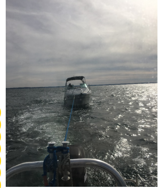
Figure 1. Disabled boat under tow to Stamford

O During the same weekend, a call for assistance was heard from a yacht towing a disabled power boat towards Stamford. The yacht had only a very small engine and was making little headway in the conditions. TowBoat US was already committed so the Harbor Master attended and took over the tow (see figure 1) near Green #32 returning the boat to Brewers Marina. The single manned SPD Harbor Unit offered to