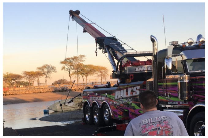
Figure 3. a large tow truck was needed to remove the yacht from the water.